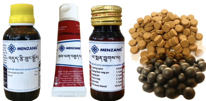
Traditional medicines and over-the-counter products

Menzang Meaning ‘good medicine’ is a range of pain-relieving herbal products developed from ancient Bhutanese texts under the guidance of traditional medicine practitioners. All Traditional Medicines and Over-the-counter Products are manufactured under Menzang Brand.